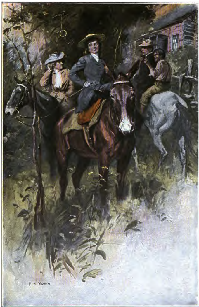
"Mart's a-gittin ready for a tourneyment."